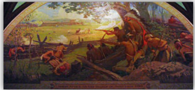
Mural of the Battle in the Missouri State Capitol