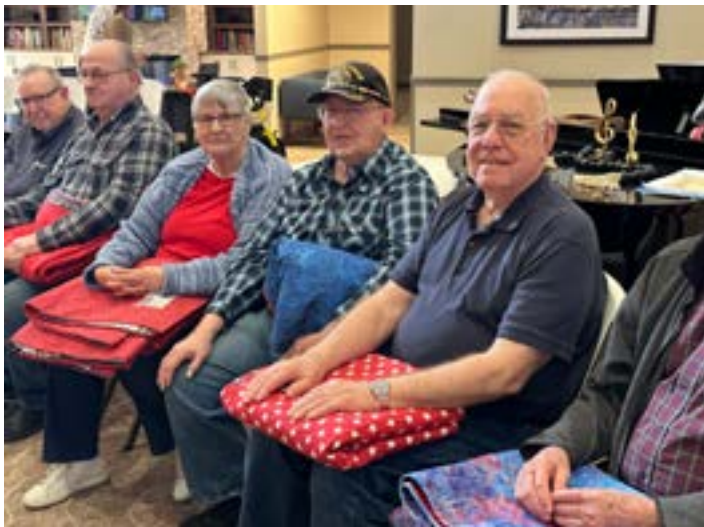
Veterans with their quilts.