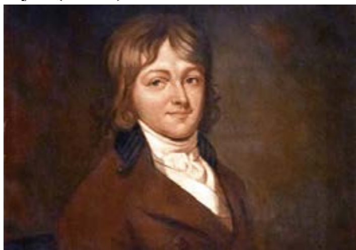
Francis Scott Key

Francis Scott Key (1779–1843) – A lawyer and amateur poet, Francis Scott Key immortalized the defense of Fort McHenry during the War of 1812 by penning the words that would become the U.S. national anthem, "The Star-Spangled Banner." He witnessed the British bombardment and was moved by the sight of the American flag still flying at dawn. His poem captured a nation's resilience and spirit. Though he continued in law and public service, it is his powerful verses that earned him lasting fame. Key's contribution helped