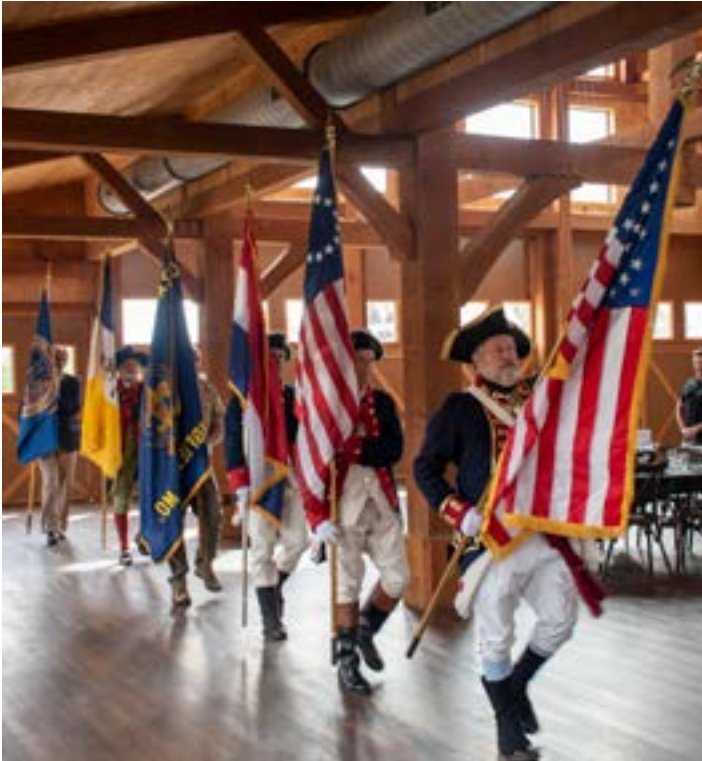
Color Guard advancing Colors.