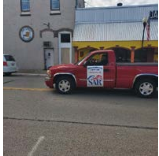
Chapter members at two Veterans Day Parades on November 8.