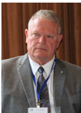
Executive Vice President