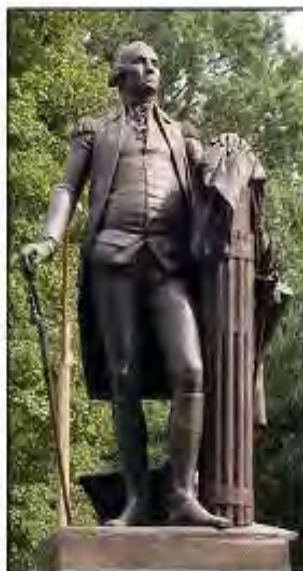
George Washington Statue in Lafayette Park – St. Louis, Missouri