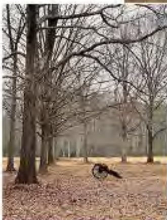
Park during his 4-day trip.

Missouri Society and received streamers from the Daniel Morgan chapter. He wasn't done yet. He later visited the King's Mountain