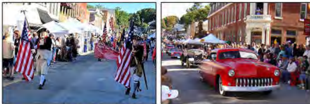
The 34 th Annual Applefest Opening Day Parade in Weston, Platte County, Missouri