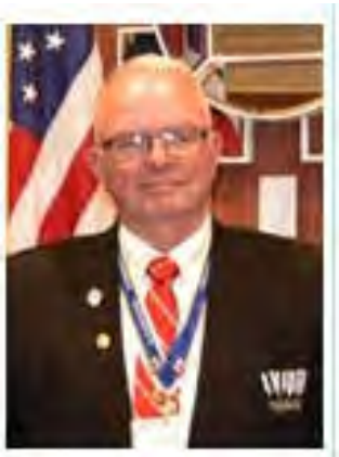
First Vice President