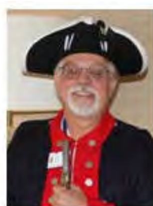
Second Vice President