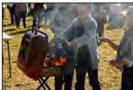
Participates in the flag retirement ceremony.