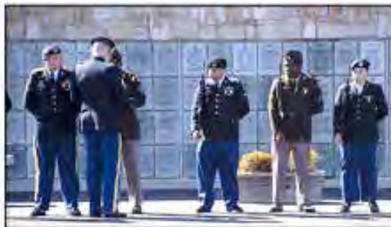
Patriot Guard undergoing inspection