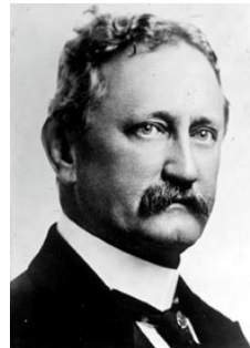
David Rowland Francis (1850-1927)