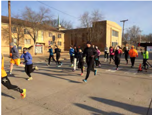
Photo from our past race.

We restarted our meetings in September 2021 having last met in February of 2020. With Covid-19 abated, we sponsored our biggest event and sole fundraiser for the year with a Presidents Day 5k Race on Saturday, 19 February 2022.