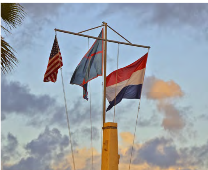
Flags flying in celebration over Statia Day