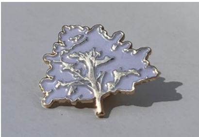
Convention Fund Pin – $15 donation