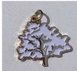
Convention Fund Charm – $10 donation