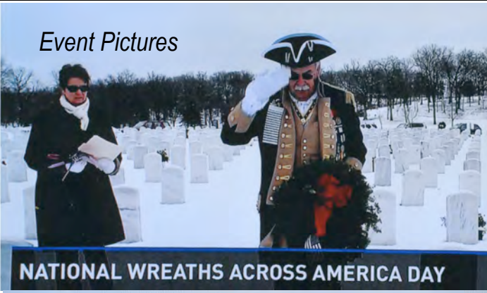
NATIONAL WREATHS ACROSS AMERICA DAY